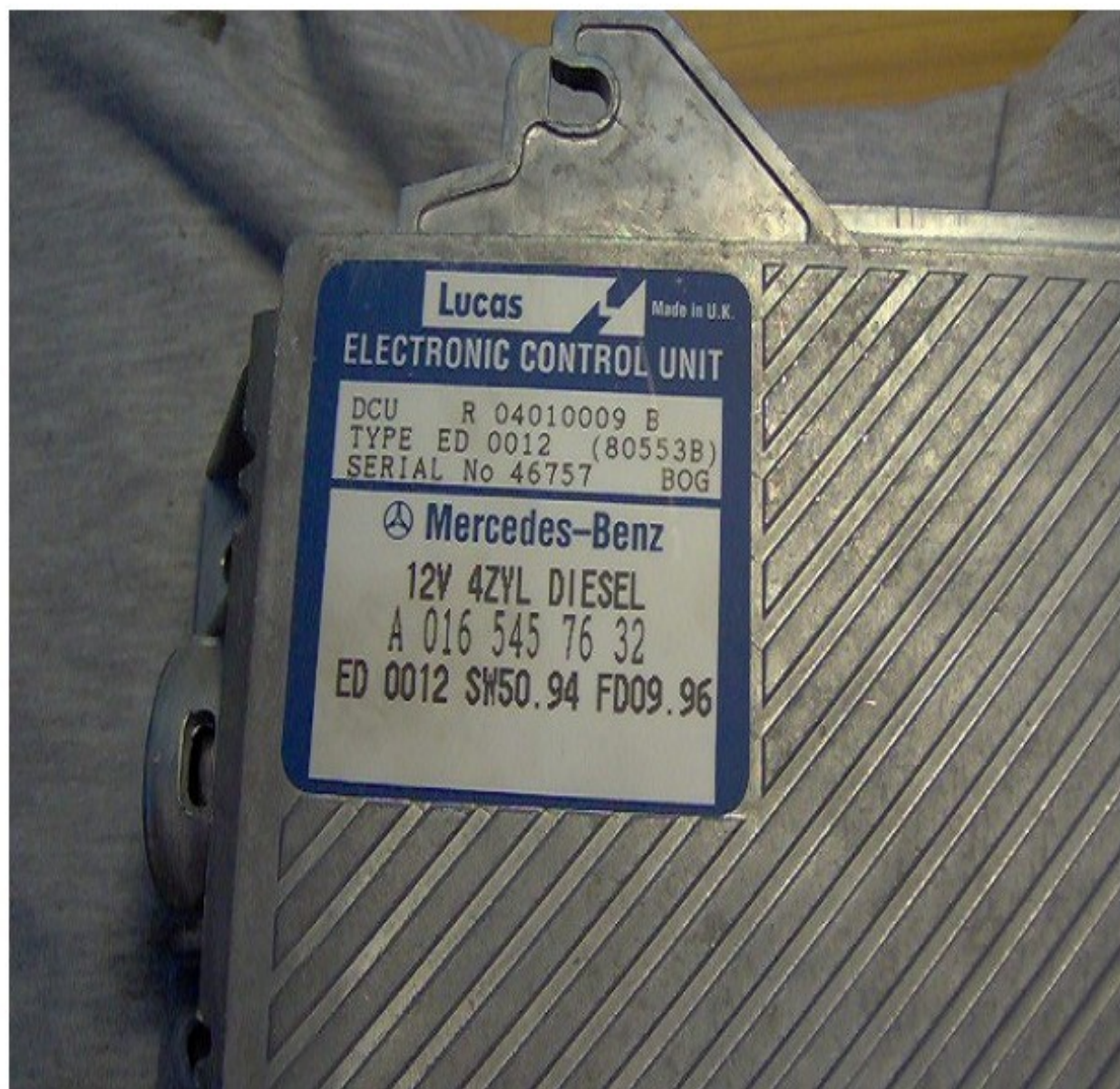
ECM Lucas 1 plug 55 pins.