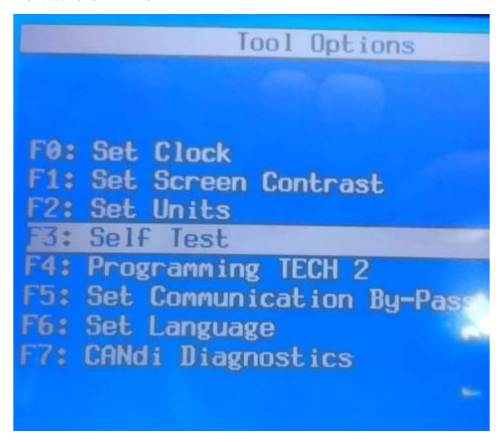
5 Press "Exist" to continue